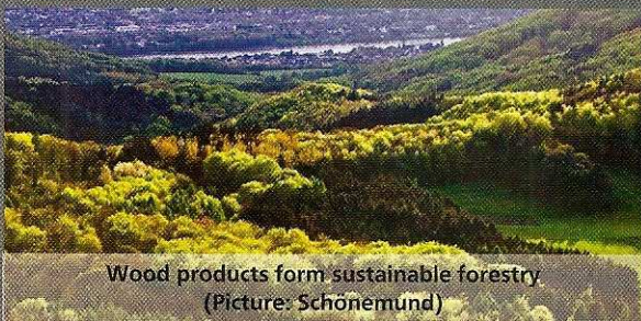
Wood products form sustainable forestry

Germany is home to Europe's largest wood resources (3.4 billion m 3 ) and largest production of sawn timber (2009: 20.5 million m 3 including planed products). In 2009, Germany exported more than 6.2 Mio m 3 of softwood sawn timber (including planed products). Based on the presence of 150,000 companies, annual sales of approx. 170 billion EUR and almost 1.2 million employees, the German wood industry cluster is a key global player.